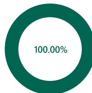
Target investment mix